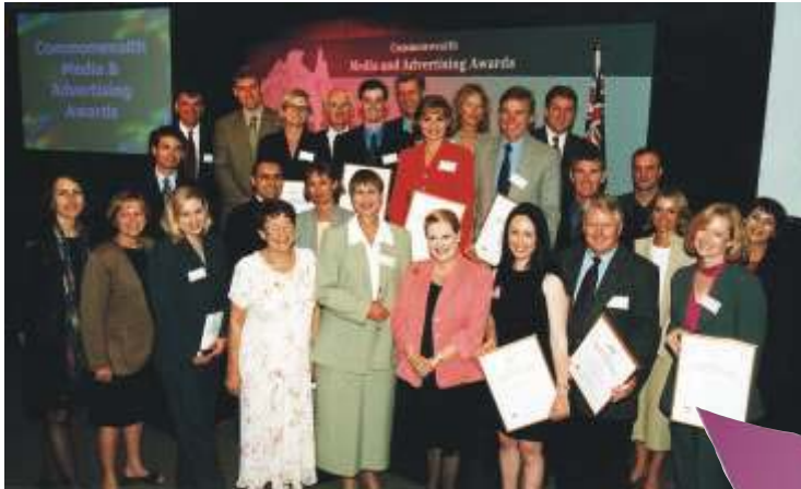
The 2000 media awards winners and finalists . . . see inside for a full list, and turn to the back page for more pictures.